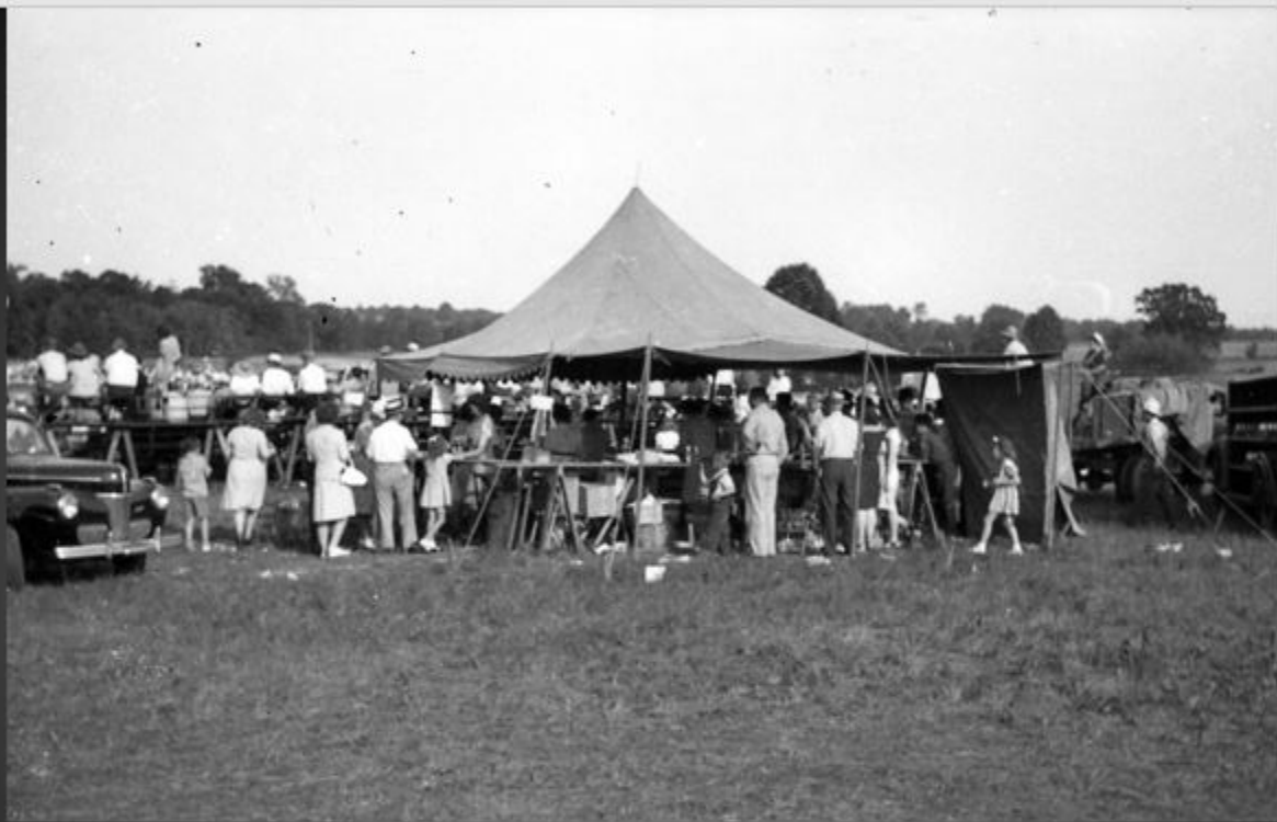
Horse Show To Raise Money For Fire Truck. McCutchanville Club Grounds Middle 40s