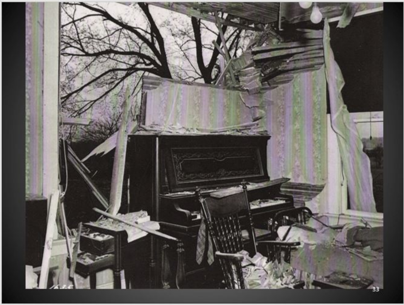
Picture from Republic in the living room.