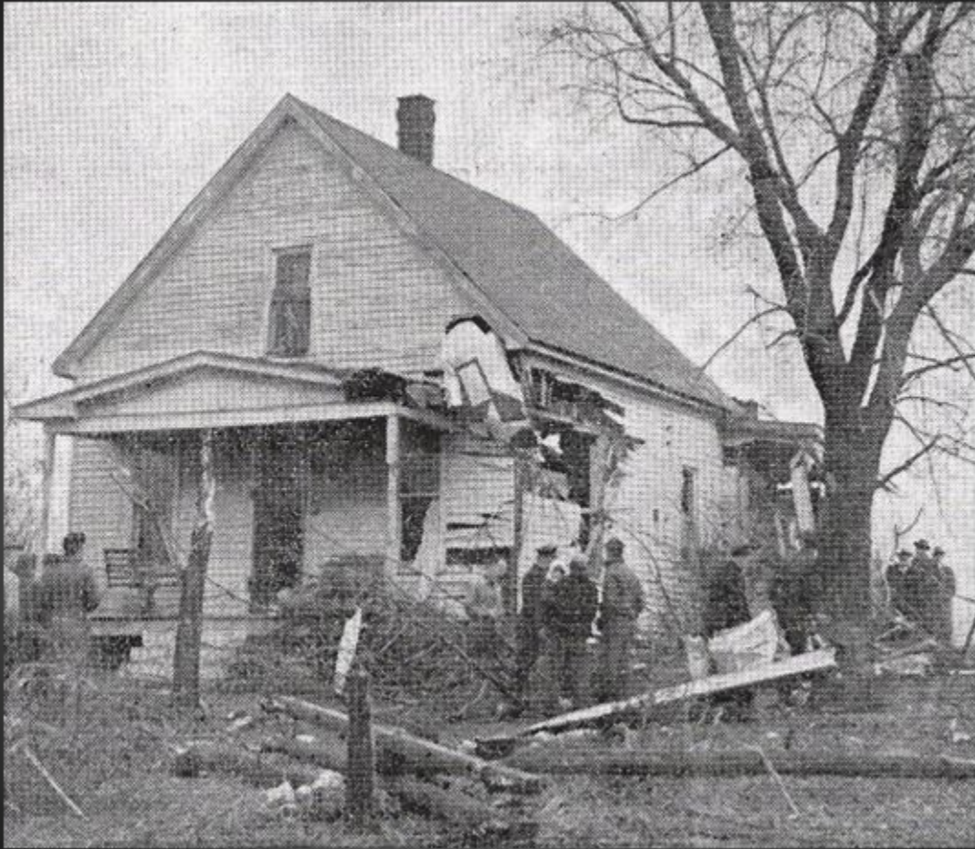
Picture from the paper showing the house.

It can be seen in this picture his left wing hit the house high and the right wing hit the base of the tree. That took both wings off and the fuselage slid down the hill. The pilot jumped out ran back up the hill to see if anyone was hurt.