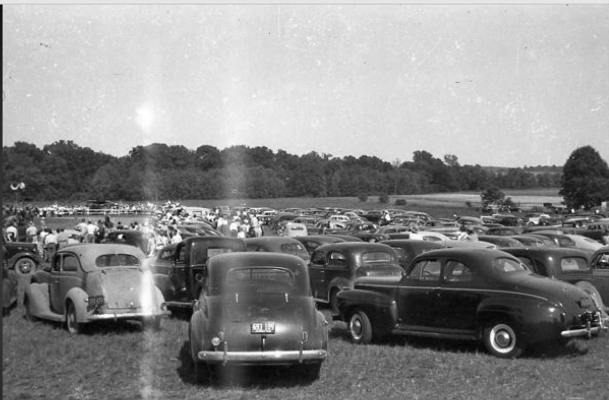
Horse Show To Raise Money For Fire Truck. McCutchanville Club Grounds Middle 40s.