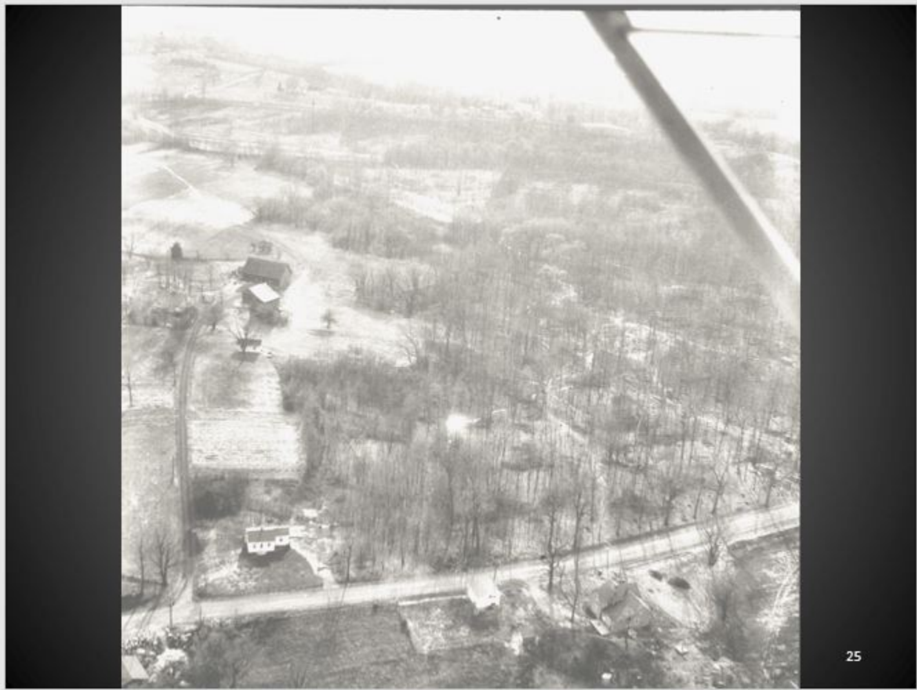
Browning Road at Molls lane, Fosters, and Swopes.