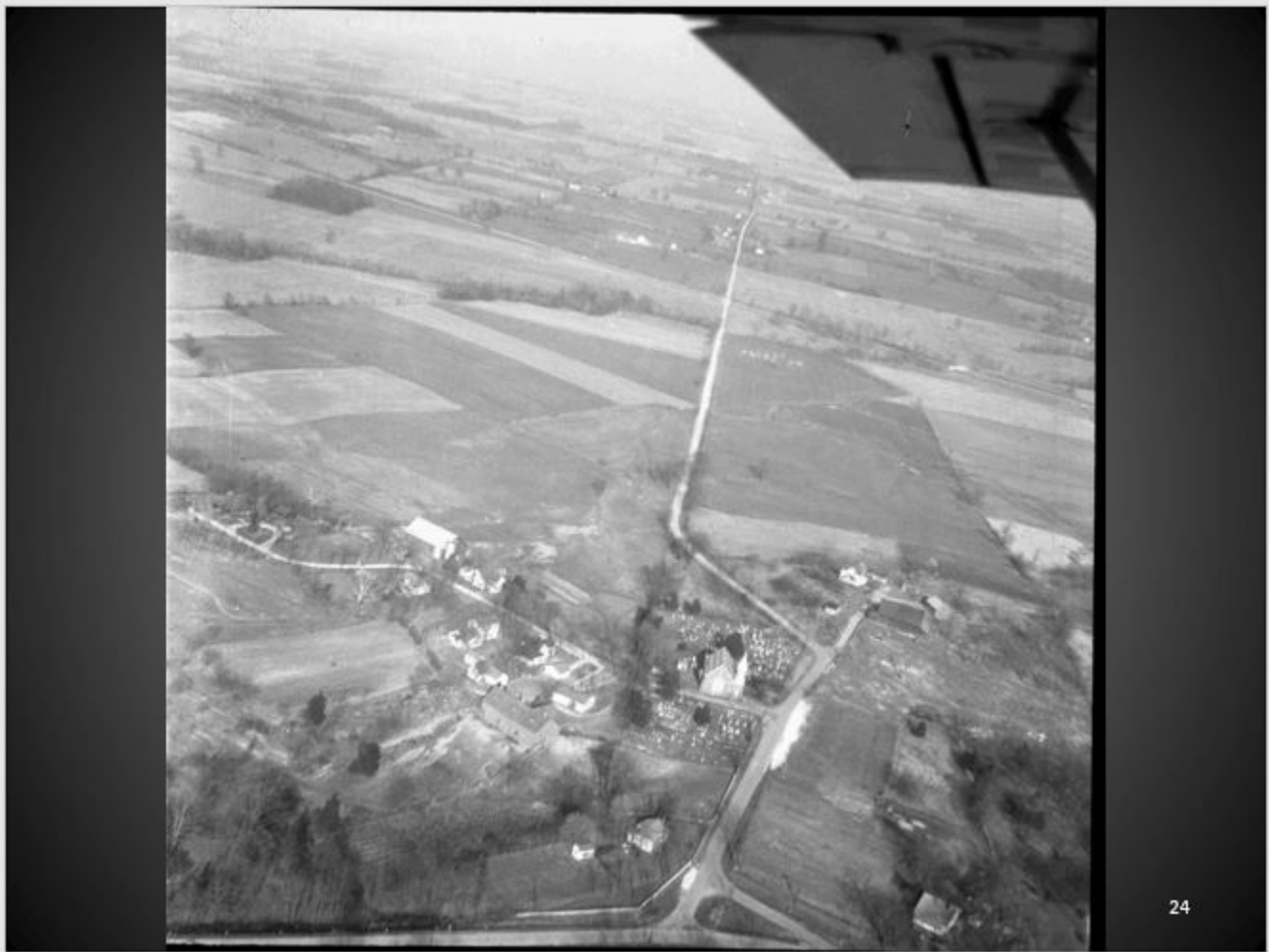
High views looking east.