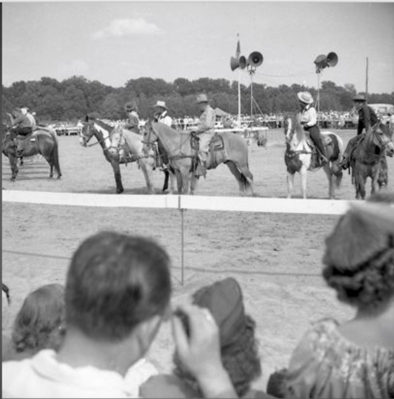
Horse Show To Raise Money For Fire Truck. McCutchanville Club Grounds Middle 40s