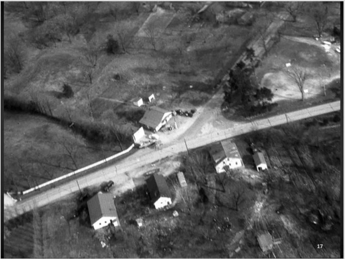
The intersection of Petersburg Road and Wheatstone Road.