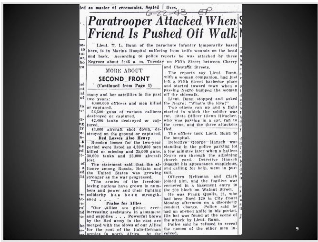
Article about stabbing.

Anyway the men had set up they were going to go to town and clean out the black area. Some said that they even asked the solders that were scheduled to come in town from Breckenridge who would be on week end passes. It was claimed that some even had live grenades and live ammunition. Evansville was closed down and passes were canceled. No one from Breckenridge or the 502 was allowed out. The next day the officer in question stood at the intersection in front of Dads store getting the word out that he had not been hurt. By the next weekend it had all blown over.