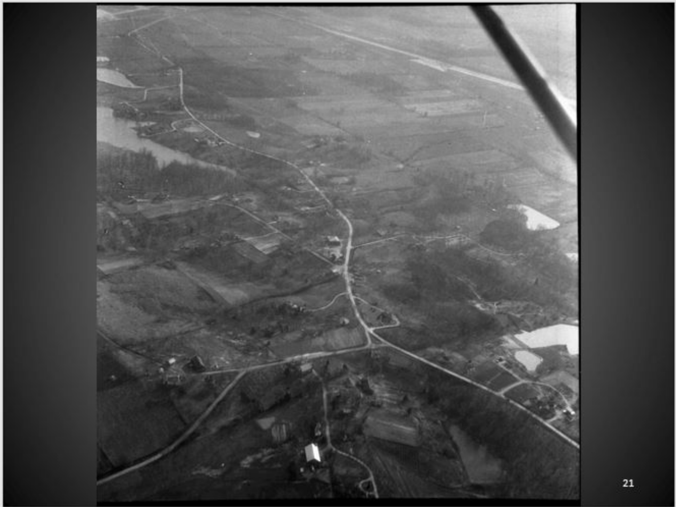
High view looking south.