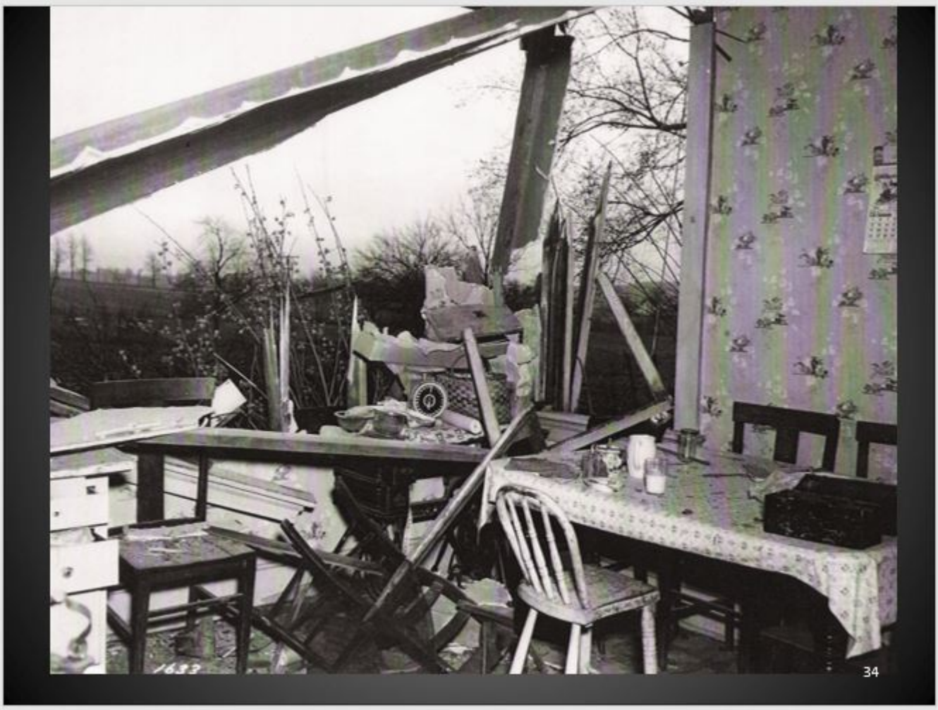
Picture show dining room.