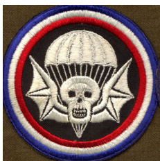
502 Parachute Infantry Pocket Patch.

Three right in McCutchanville and Head Quarters Company down behind the Evansville airport. Of the ones in McCutchanville, one Company about a half mile up Browning road from Petersburg Road, on the north side, no houses at that time. The second was at what is now the McCutchanville Park. The third was on the east side of Lake Talahi, there were no houses on the east side of the lake at that time.