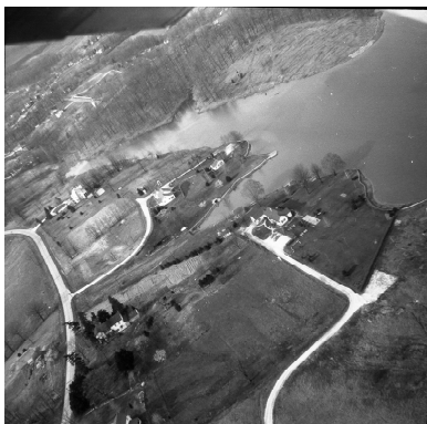
Lake showing nothing on east side.

Three right in McCutchanville and Head Quarters Company down behind the Evansville airport. Of the ones in McCutchanville, one Company about a half mile up Browning road from Petersburg Road, on the north side, no houses at that time. The second was at what is now the McCutchanville Park. The third was on the east side of Lake Talahi, there were no houses on the east side of the lake at that time.