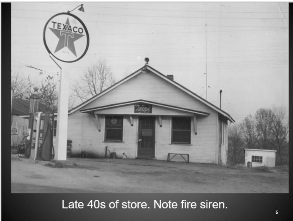
Late 40s of store. Note fire siren.

paratroopers in front and the antenna on the store.