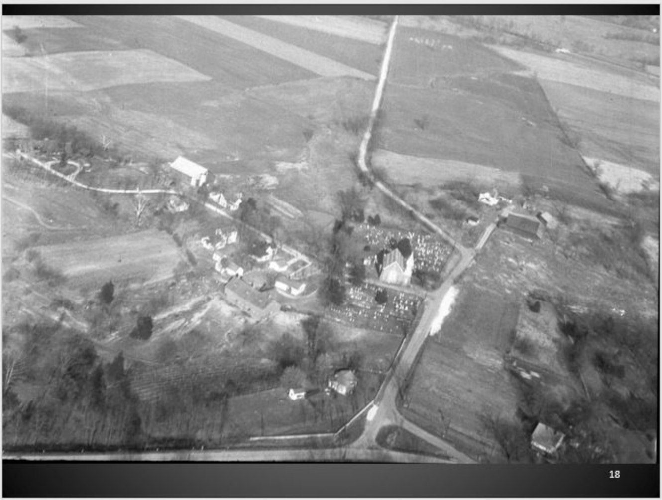
Shows the church, intersection Wheatstone and Petersburg Road, also Moffett Lane has been rerouted.