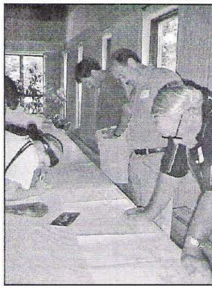
Checking family tree.